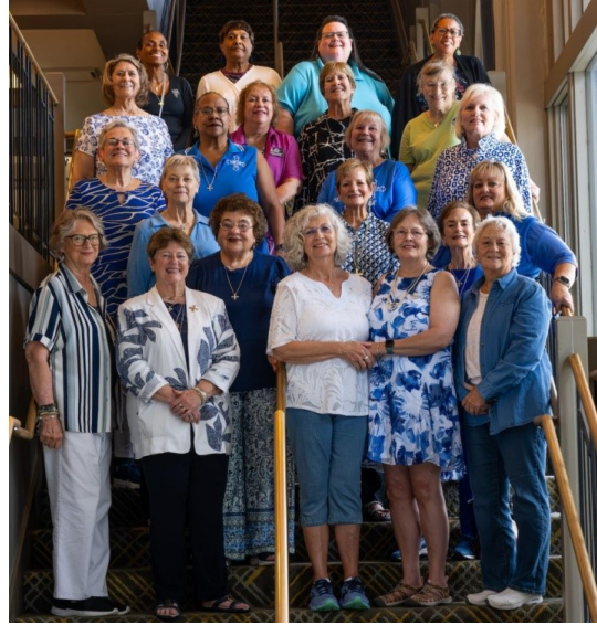
Province IV had several Daughters who were elected to the 2024-2027 National Council.