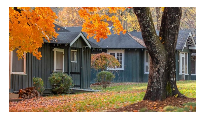
Historic Cottages at Kanuga Conference Center