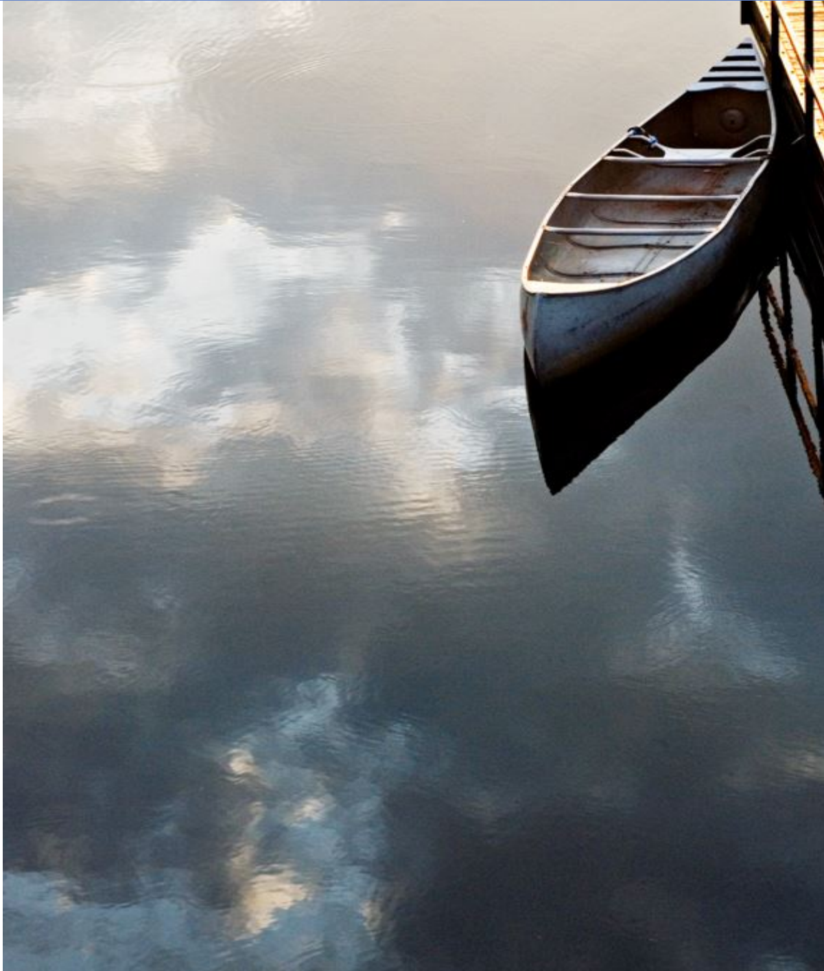
Kanuga Conference Center

THE NEWSLETTER OF PROVINCE IV - FALL/WINTER 2019